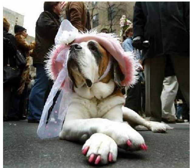
In my Easter Bonnet, with all the frills upon it, I'll be the grandest lady in the Easter Parade!

Easter Altar Flower Donation Envelopes available in the hallway. May be given as memorials or in thanksgiving. Return completed envelopes to the Office mail slot in choir room or mail into the office. DUE DATE: March 25