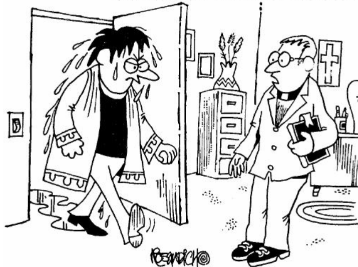
"I take it the Baxter baby wasn't very cooperative during the baptism."